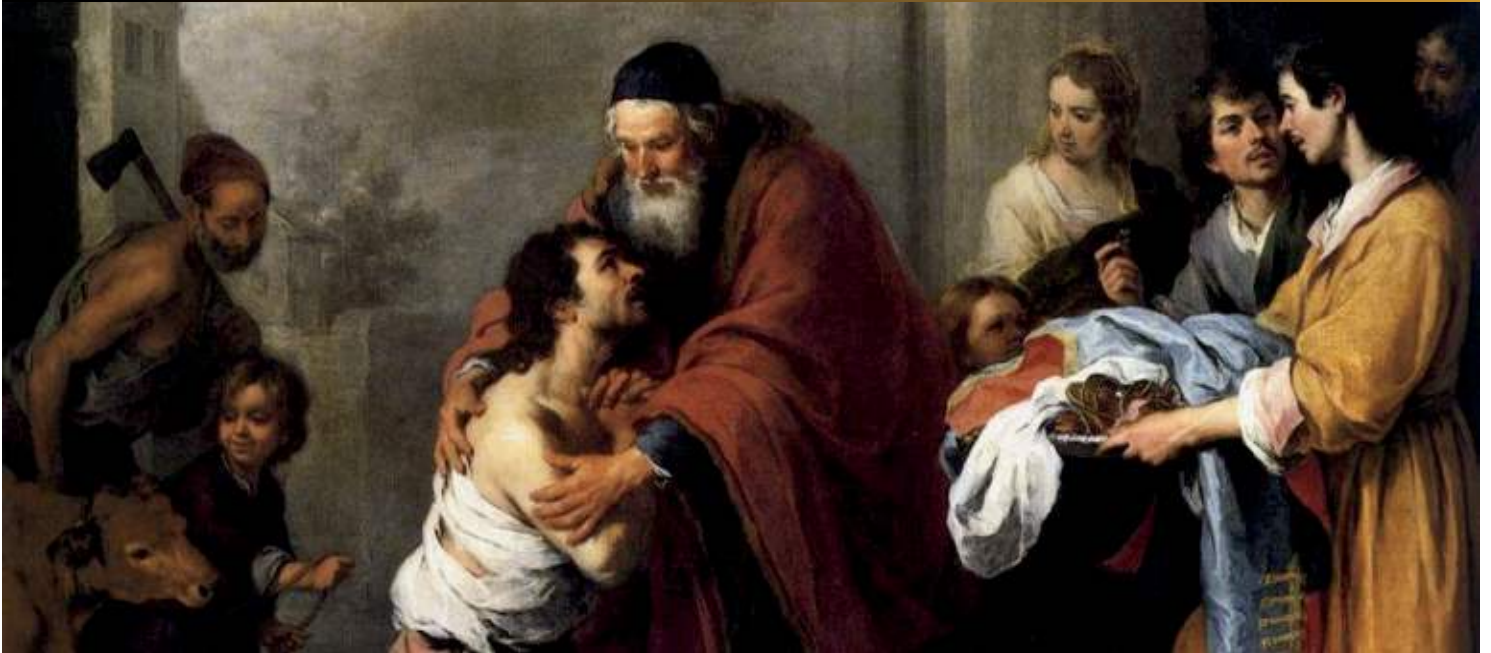
The Return of the Prodigal Son, Bartolome Esteban Murillo